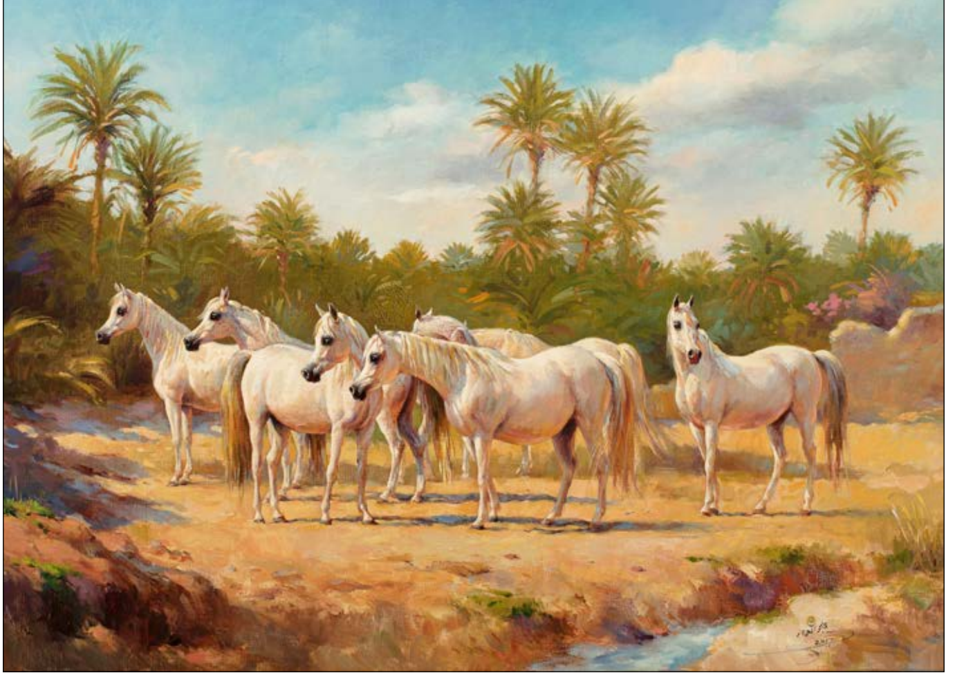
A Tale from Albadeia