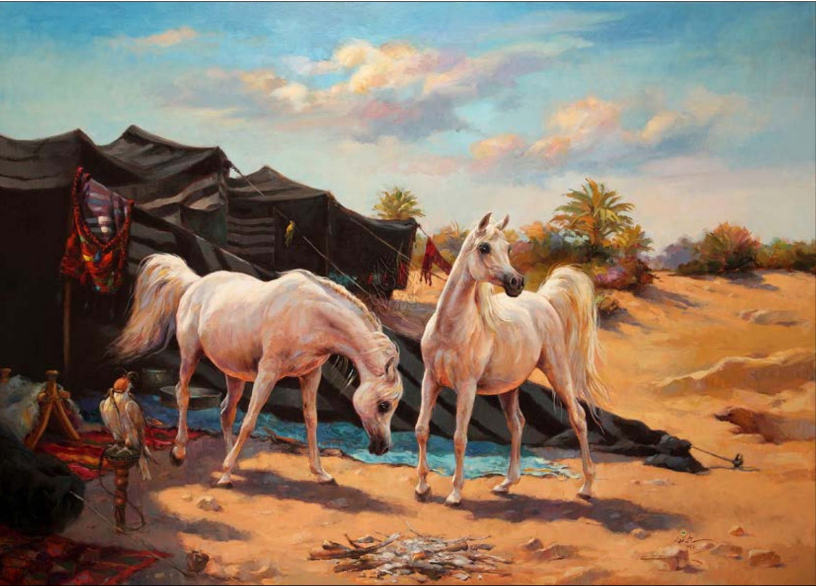
Longing For The Past