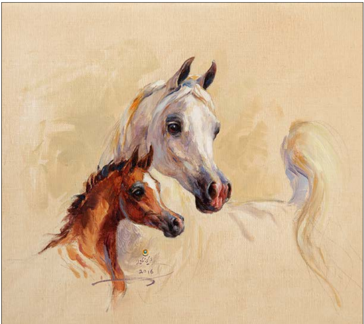
An Unconditional Love