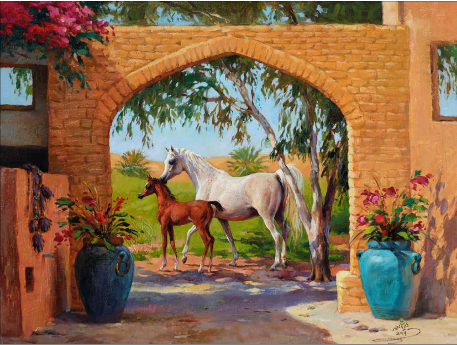
A Tale from Alzobair