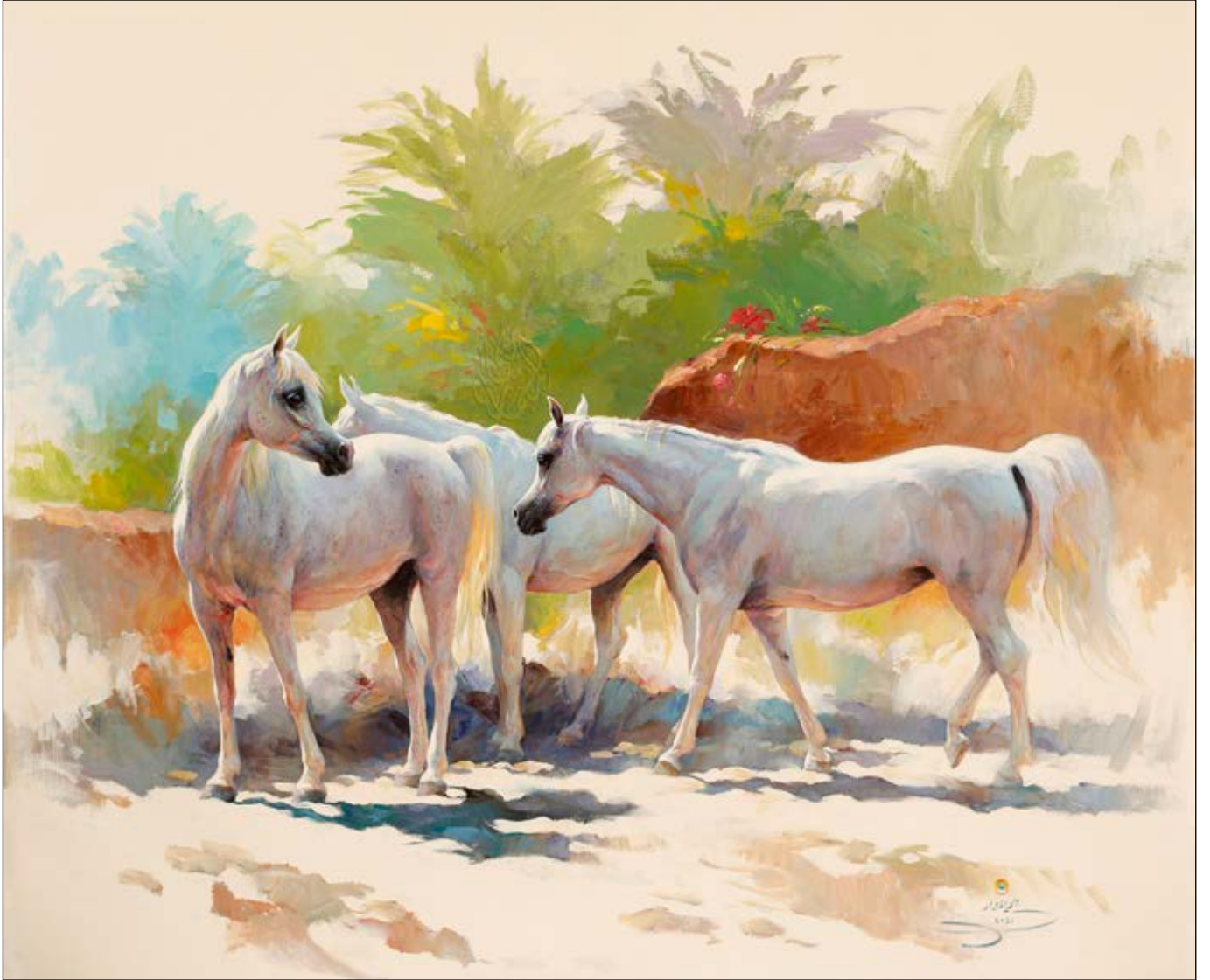
Journey with the sun